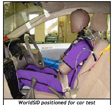
WorldSID positioned for car test

In total, testing has included nearly 1000 whole dummy biofidelity, vehicle, and component tests. This testing was conducted in sixteen different test labs and agencies in at least ten different countries including governmental agencies in Canada, Japan, Australia, the United States and various organizations as part of a framework research program of the European Commission.