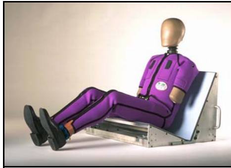
WorldSID Pre-Production Dummy

of crash dummies to duplicate human motions and responses in side impact tests, which should lead to improved vehicle designs and occupant protection. In addition, WorldSID, which was developed by hundreds of engineers and scientists from over 45 organizations in Europe, Asia-Pacific and the Americas, represents a major breakthrough in worldwide harmonization of crash test dummies.