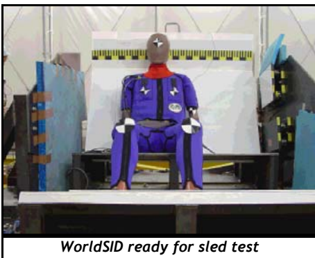
WorldSID ready for sled test

The WorldSID heralds a significant improvement in the ability